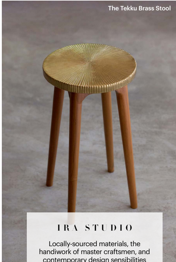
The Tekku Brass Stool