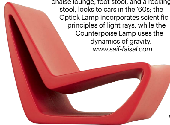
The LeggeraGT Series chaise lounge

The Bengaluru-based designer draws from his experiences in architecture, the mechanical department of Formula SAE-Racing, and wood working, bringing together craft and technology. The LeggeraGT Series, comprising a chaise lounge, foot stool, and a rocking stool, looks to cars in the '60s; the Optick Lamp incorporates scientific principles of light rays, while the Counterpoise Lamp uses the dynamics of gravity. www.saif-faisal.com