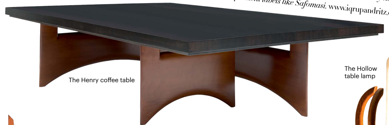
The Henry coffee table