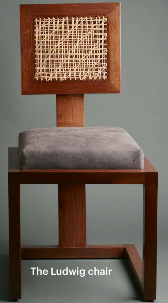
The Ludwig chair

What started as a project to refurbish old furniture has now evolved into a design collective for bespoke furniture and spaces. Their latest collection, Figments, consists of a coffee table, bench, chair, console, and side table, handcrafted using cane, steel, glass, and wood at their workshop in the capital. Centred on the idea of memories, the pieces offer a modern narrative to Indian craftsmanship traditions. www.studiowood.co.in