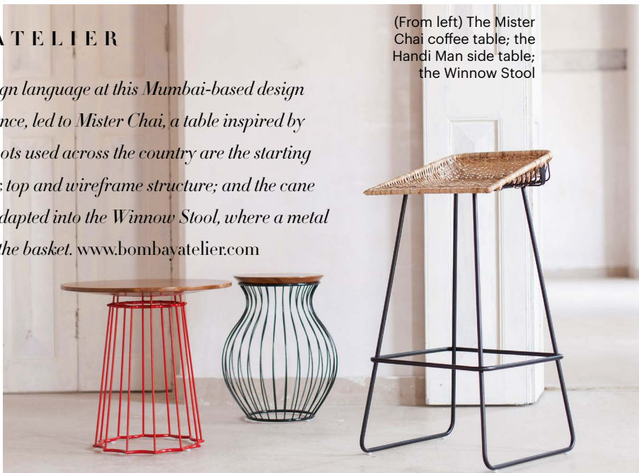
(From left) The Mister Chai coffee table; the Handi Man side table; the Winnow Stool

Everyday life in urban India informs the design language at this Mumbai-based design company. The ritual of drinking tea, for instance, led to Mister Chai, a table inspired by scalloped tea glasses; the terracotta or metal pots used across the country are the starting point for the Handi Man, which features a teak top and wireframe structure; and the cane woven baskets used to separate rice grains are adapted into the Winnow Stool, where a metal lattice framework creates the shape of the basket. www.bombayatelier.com